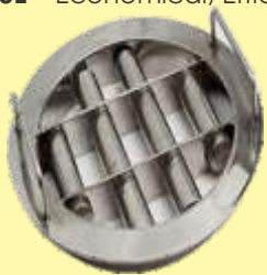
Round, Square / Rectangle Grill